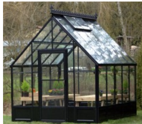
Top: Tier One